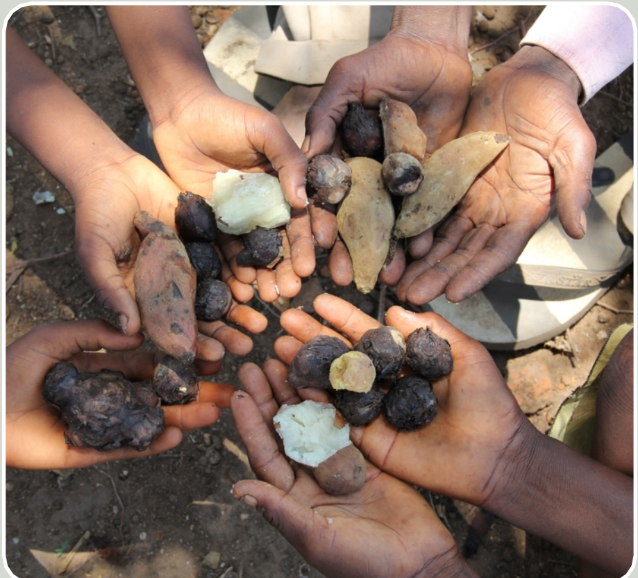
Below: Two full days' food for the four-member Mkweza family in Chikwawa, Malawi.